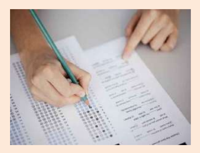
NTA to conduct NEET and JEE Main in December 2018 again?

National Testing Agency, NTA is expected to conduct its first examination in the month of December 2018. As per the information available, NTA is expected to be fully operational within a few months and would conduct the JEE Main for the 2019 academic session in December 2018. The agency is also expected to conduct the first phase of NEET 2019 in December 2018. The official confirmation, however, has not been issued by MHRD as yet.